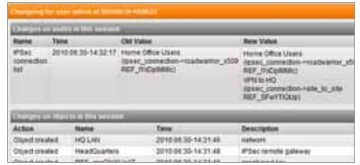
Admin Change Tracking