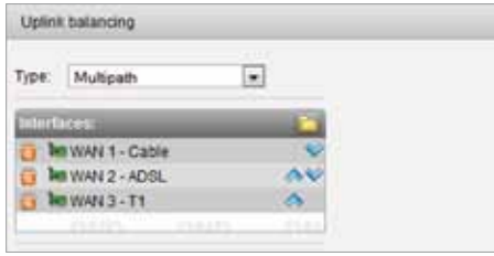
WAN Link Balancing